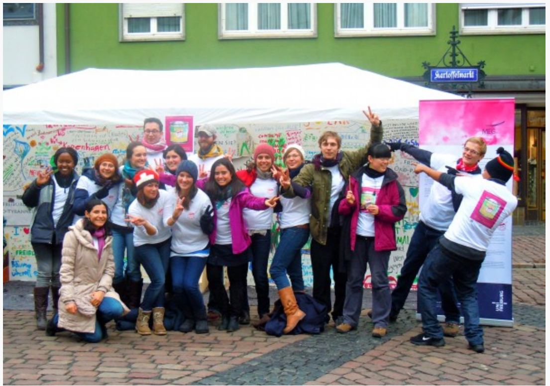
MEG 7 Class